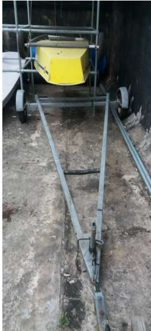
Willy's Osprey – Numbered on axle