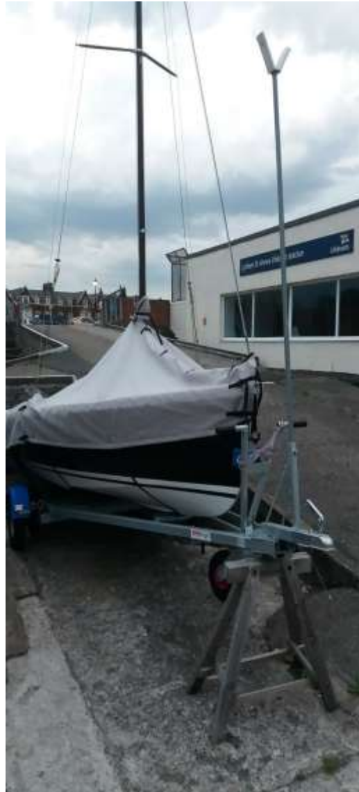
Wayfarer – Owned by Lanigan. New bright metal road base with tall mast support