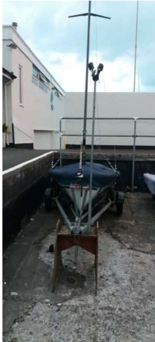
Phantom – Owned by Martin Knott, normally identifiable by considerable padding (foam pipe lagging), mast support & black plastic wheel arches