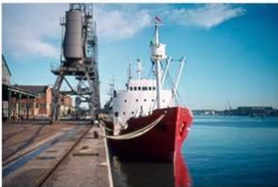
The British Antarctic Survey vessel RRS "John Biscoe" at Southampton