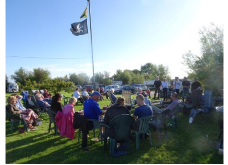
The RNLI shanty crew performing at the dock BBQ