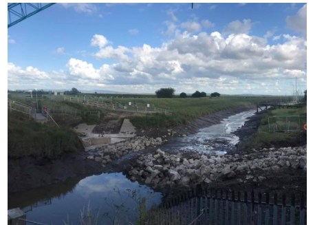
Works on the sluices by the Environment Agency continue, this was the status in June